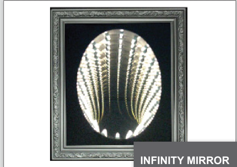
INFINITY MIRROR ITEM # 3361-00